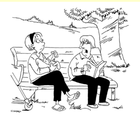
"Oh, yeah, they're cute until you can no longer claim them as dependents on your tax return."

Although introduced in February this year, it is not entirely clear whether the robot can actually be purchased or what it will cost.