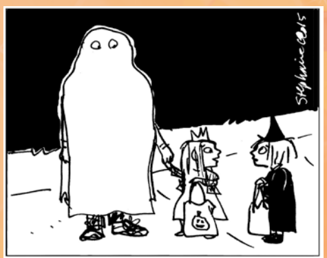
"Oh that's my brother. He doesn't want his friends to recognize him."

Most bulbs prefer a 45 to 55-degree temperature range. Begonias, gladioli, and cannas prefer 50 to 60 degrees.