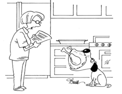
"Let's go over this again. Anything that hits the floor is yours, with the following exceptions..."

Cable boxes run about $20 per box per month, but a DVR can be purchased for $100 to $175, according to cableboxandmodem.com. These boxes require $3 cable card; which cable companies are required to sell.