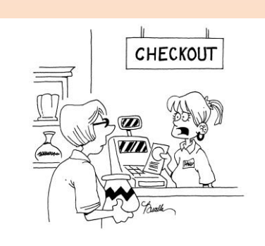
"Cash? Gee, I'm new here and I haven't been trained in making change. Would you like to open a store charge?"

If you've been too busy to develop specific sports skills, there's still a lot you can do to take advantage of summer and fall. In addition to hiking and biking, consider walks in the woods or around your neighborhood. Walk your dog. Join friends walking.