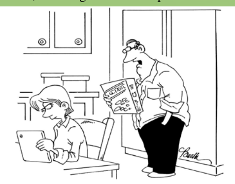
"Do we have any low calorie food? The doctor told me to stick out my tongue and say, 'Oink."

Interestingly, a study in 1976 published in Science magazine speculated that the girls might have had convulsions because of a fungus found in cereals. Toxicologists say the fungus can cause delusions, vomiting and muscle spasms.