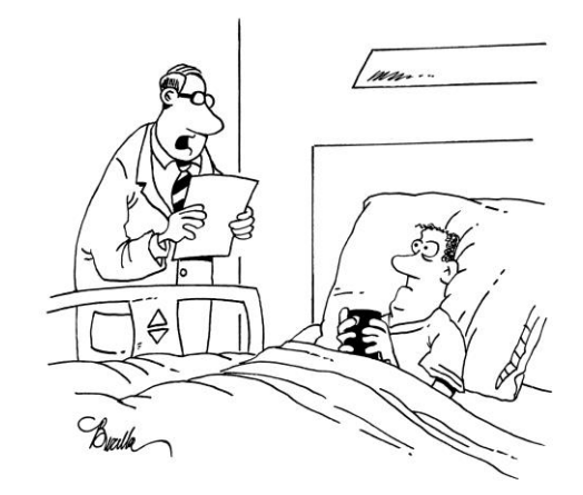
"Other than your choice of ring tone, I can't find anything wrong with you."

For more information, visit the Appalachian Trail Conservancy at www.appalachiantrail.org.