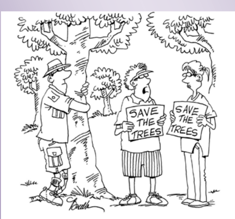
"I remember a time when he used to hug me like that."

Caring and understanding: Understanding people at different points in the aging journey.