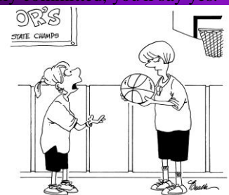
"I'd like to participate in gym class, but I'm afraid I'll get overheated and contribute to the global warming problem."

The two of them have formed The Last Minute Gang, an informal group of a dozen friends or couples, people who have agreed that, at the last minute, if someone calls and invites you to do something, unless you're previously committed, you'll say yes.