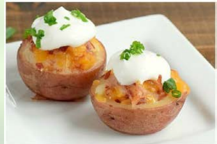
Irish Potato Bites home made interest.

Let the morning bring me word of your unfailing love, for I have put my trust in you. Show me the way I should go, for to you I lift up my soul. — Psalm 143:8