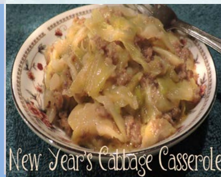
New Year's Cabbage Casserole

Transfer entire mixture into the casserole dish, cover tightly with heavy foil and bake for one hour. Remove from oven, stir to mix everything, as there is a thick sauce that is made during the bake time, and allow to cool for 10 minutes before serving. Serves 6-8.