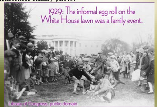
1929: The informal egg roll on the White House lawn was a family event.

Today, the White House holds a lottery to distribute 35,000 tickets for the Egg Roll. If you win one, get ready for hours of lines and a fairly short experience on the White House lawn, but a very memorable family photo.