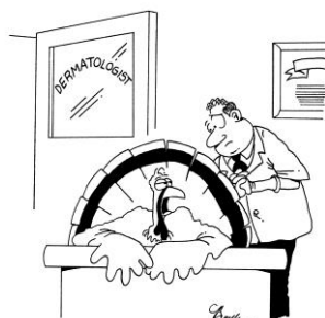
"We all do a lot of stupid things when we're young. So, what'll take to remove that 'Butterball' tattoo?"

* "Organic" salt. Consumers should be skeptical of claims that salt is organic. Salt isn't grown, like a plant. There's no USDA standard for it. In some countries, so-called organic salt is dried from selected waters and contains no additives.